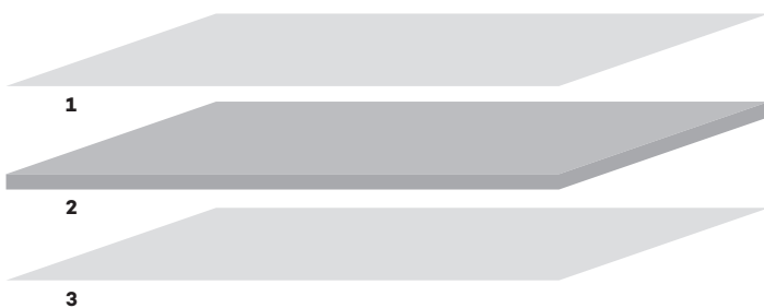
PLEXIGLAS® proTerra solid sheets with two coextrusion layers

• Collecting and sorting • Regranulating the residues and waste of semi-finished PLEXIGLAS® products